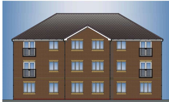
TYPE M1 & M2 2B3P 61 Apartments REAR ELEVATION