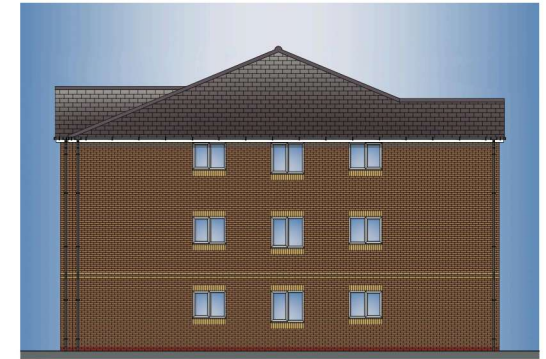
TYPE M1 & M2 2B3P 61 Apartments SIDE ELEVATION