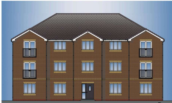
TYPE M1 & M2 2B3P 61 Apartments FRONT ELEVATION