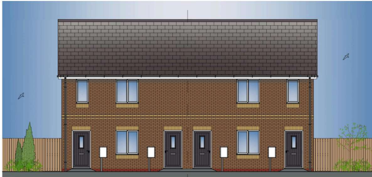
Type P1 & P2 Front Elevation - 1B2P Maisonette 50 & 57 1 Bedroom 2 Person Maisonette (50m 2 & 57m 2 )