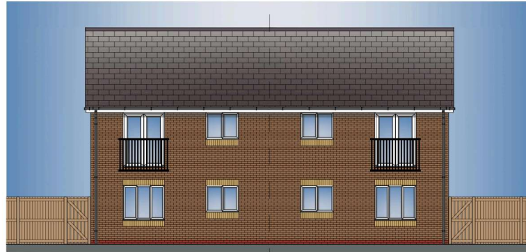
Type P1 & P2 Rear Elevation - 1B2P Maisonette 50 & 57 1 Bedroom 2 Person Maisonette (50m 2 & 57m 2 )