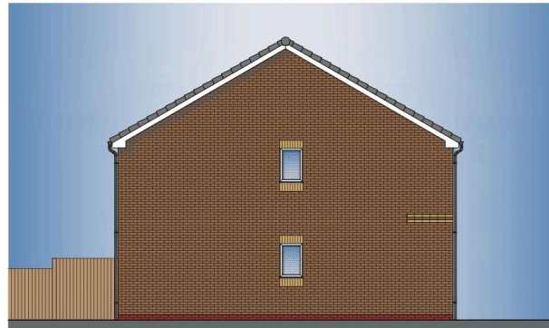
Type P1 & P2 Side Elevation - 1B2P Maisonette 50 & 57 1 Bedroom 2 Person Maisonette (50m 2 & 57m 2 )