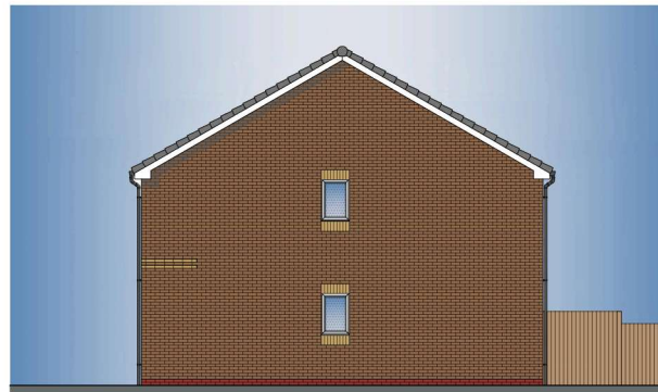
Type P1 & P2 Side Elevation - 1B2P Maisonette 50 & 57 1 Bedroom 2 Person Maisonette (50m 2 & 57m 2 )