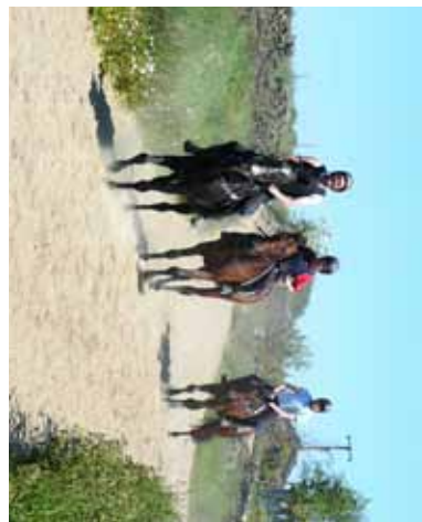
Horses training on Birch Close Lane