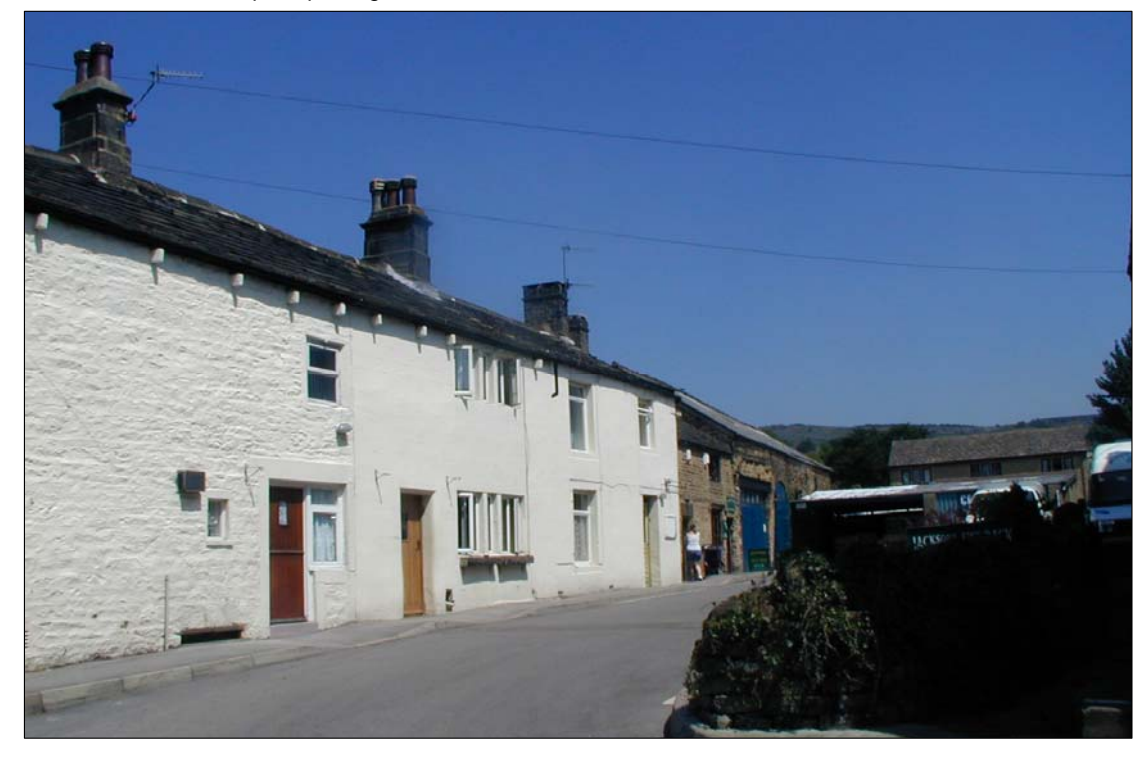
Agricultural style properties of Mitchell Lane off St. John's Road (Grade II) - illustrative of the rural character of parts of the settlement.

south, or more prominently via a stone footbridge over the weir from Kirkgate. The footbridge was constructed in 1830 to replace the former packhorse bridge. The northern most end of the street is highly visible from Kirkgate and forms a focal point of the town; the L-shaped cottages with setted front area and hedge are particularly prominent. The buildings of the road are characteristically small stone cottages with a number of farm buildings to the north. The street itself has three distinct areas: the cottages on the south-western side of the street, these are