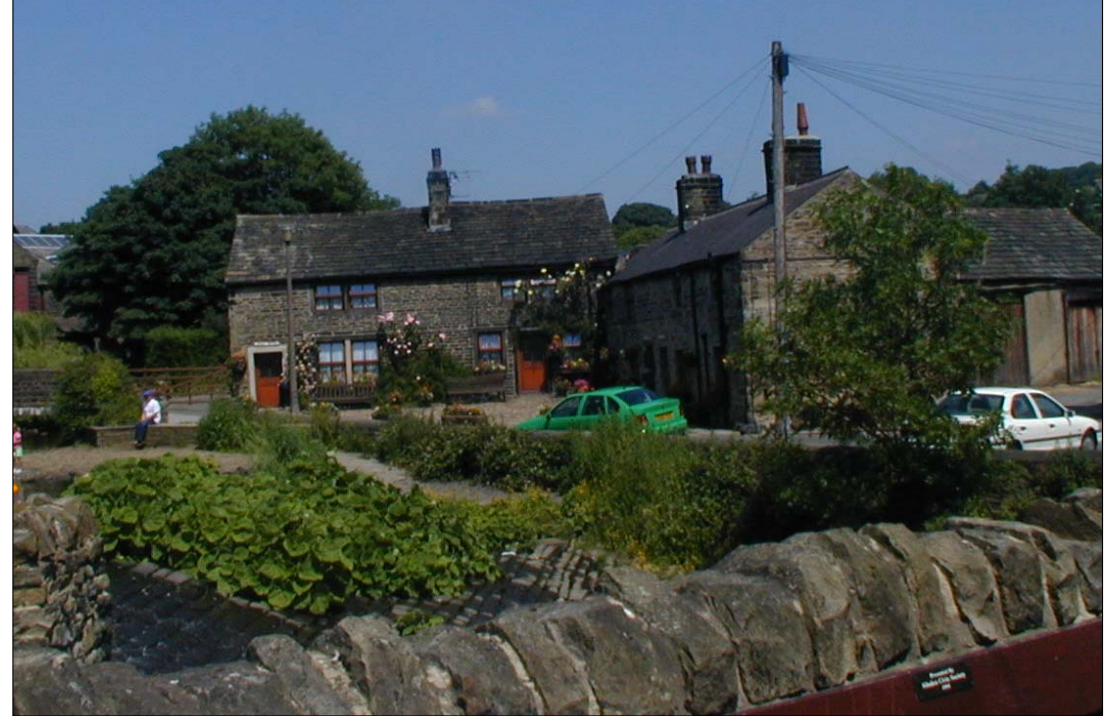
Prominent cottages to the north of St. John's Street (unlisted) - constructed of local sandstone, with stone slate roofs.

The conservation area has an abundance of small cottages, which because of their simplicity in design and construction materials classify as vernacular structures. The dates of these buildings range from the mid-seventeenth century to the nineteenth century and were constructed to house farm workers, cottage industry workers and latterly