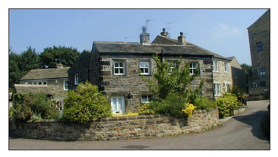
Good quality new development within the conservation area, which is clearly modern, yet integrates well with the adjacent listed buildings