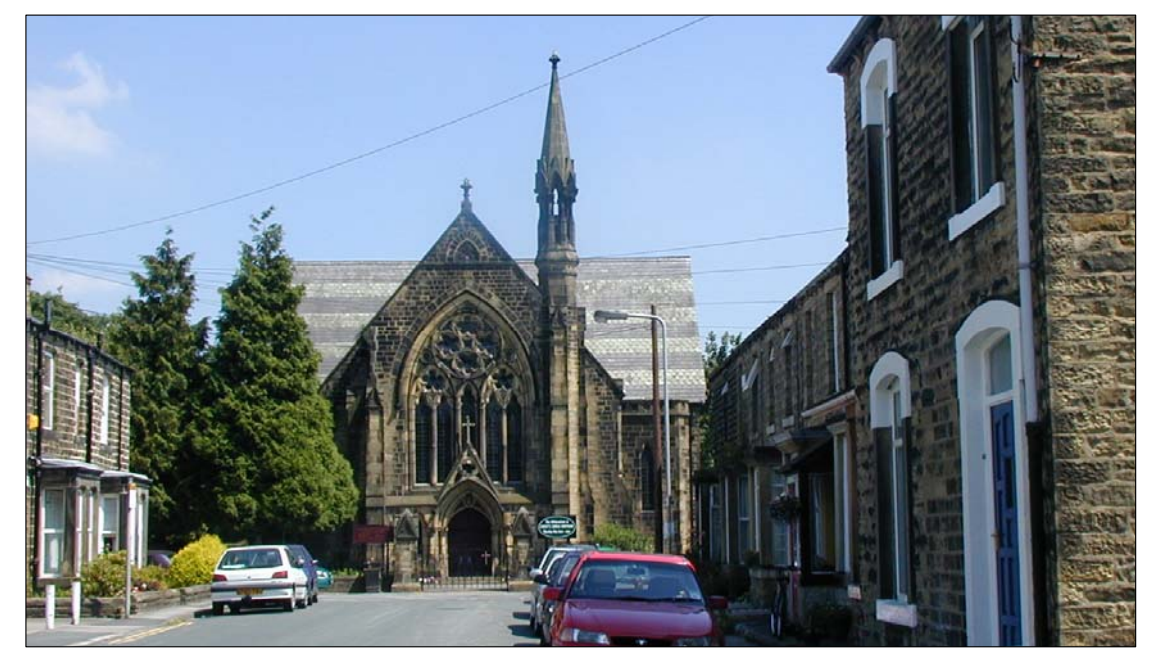
The Roman Catholic Church (Grade II) of Wesley Place (originally Wesleyan) -Has a clear Gothic style.

structures in their own right; these are richly moulded in an Art Nouveau style with a butterfly motif. Finally the Methodist Church, although of little architectural merit in its own right, is worthy of mention due to its size and prominent positioning within the heart of Silsden.