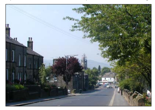
View into the conservation area from Bolton Road, encapsulating the image of a rural village.

Entering the village from the Bolton Road boundary offers a very different image of the town than if it is entered from the southern Keighley Road approach. Views from Bolton Road incorporate the rows of nineteenth century and early twentieth century terraces that flank the road, down to the retail properties of Briggate, the tower of St. James' Church, which is a landmark of the town, and out to the hills beyond. The impression is of a small rural village with its amenities. Conversely from Keighley Road the first impression is of the modern petrol station, building