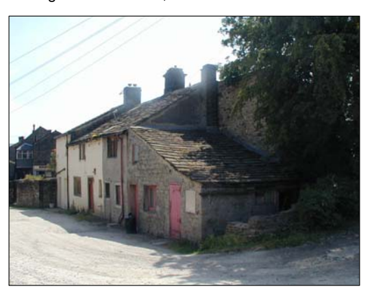
Farm buildings of Greengate (Grade II)

There are a number of other former farm properties nestled in this part of town, around Highfield Lane, Hayhills Road and Greengate. However only 4 and 6 Greengate are listed, as Grade II listed properties. The typical form of the farm buildings of the area is akin to the old longhouse design with the barn and farmhouse under one roof, or at least sharing a common wall, with further farm structures