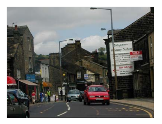
The twists and turns of Kirkgate limit vistas down the street and contribute to the intricacy of form.

The settlement now known as Silsden, or 'Cobbydale' is situated in the heart of Airedale, between the moorland of Silsden, Rombalds Moors and the flood plain of the River Aire. It nestles in the trough created where the otherwise steepsided valley of the Aire widens out into an area that is gently sloping and south-west facing. Its setting is therefore discreet and secluded. The town is surrounded by moorland and arable farmland that is protected under Green Belt policy, which provide an attractive backdrop to the streetscape of the town. The conservation area itself is situated on relatively flat land following the valley of the beck, but the ground rises gently to the west, north-east and more steeply to the east out of the conservation area. As a result of this topography, distant views into and out of the conservation area are greatly limited and its character can only truly be appreciated internally. The only clear vistas appear when one is at the centre of the conservation area looking along Bolton Road to the north-east, looking into the conservation area from Bolton Road or in and out along Keighley Road. Apart from this, Silsden orientates itself through a series of twists and bends revealing itself when explored further. The village has clear