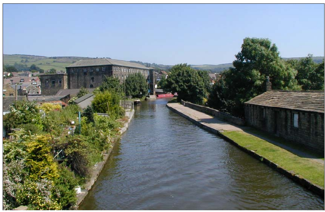
View eastward down the canal to Waterloo Mill