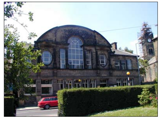
The Town Hall (unlisted) – Edwardian Baroque in style

The civic buildings that were constructed in the opening decades of the twentieth century offer a break from the vernacular tradition of the town and are reflective of the architectural fashions in this part of the country at the time that they were built. The most dominant is the Town Hall; it is Edwardian Baroque in style and has an impressive Venetian window flanked by vertical oval windows