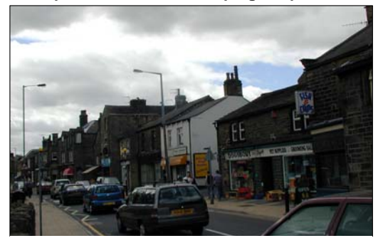
Kirkgate – some of the problems of poor quality signage and shop fronts, street sign clutter and loss of original detail is evident.

As conservation areas are identified as areas of importance to our local and national heritage, it is essential that the components of these areas that are deemed to contribute positively to their character and appearance are retained and protected from unsympathetic alteration, and components that detract from their character and appearance are improved. However, the intent of conservation area designation is not to stifle change in the area; it is recognised that to survive conservation areas must be allowed to evolve to meet changing demands and commercial pressures, and that modern additions can be just as interesting as the existing fabric, if implemented in a complementary manner. It is nevertheless essential that change in these special areas is managed in a positive way and that new development does not impinge upon, and