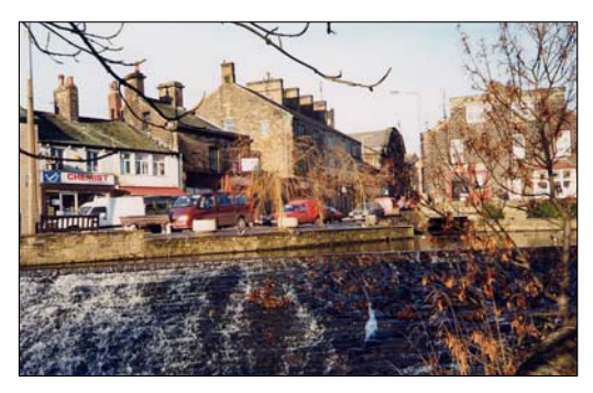
The weir of Cobbydale Beck in the centre of the town

settlement. The beck has both historical and aesthetic worth and runs the entire length and breadth of the conservation area. Visually it is most dramatic at the steep weir, where its attractiveness has been recognised and Yorkshire stone flags and benches have been installed to create a focal point to the high street. Although the beck is a visual element of much of the conservation area, it disappears underground at some points. It is particularly atmospheric where it can be viewed from the bridges of Bolton Road and Bridge Street / Stirling Street, as from here it is possible to take in views of the flow of the water and the greenery of the banks. It also offers an important perspective to the Bradley Road / Greengate area of the town, running between the two. The flow of the beck emphasises the rural feel of various parts of the town.