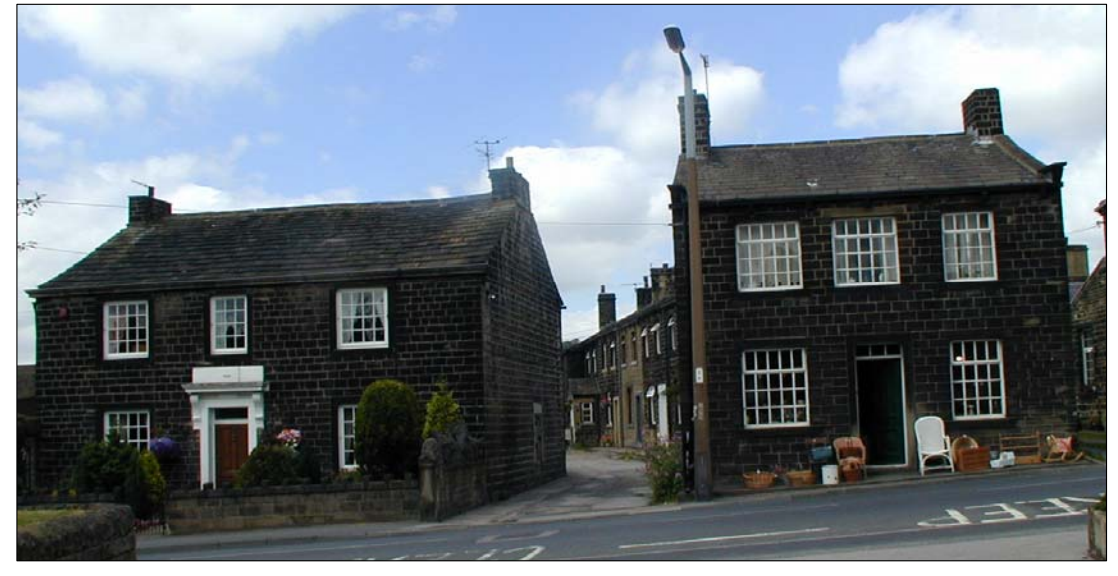
Entrance to Albert Square - typical lack of uniformity in the orientation of buildings in Silsden.

Modern development has taken over the area to the east, between Keighley Road and the Beck, which is not always complementary to the character of the conservation area, but testifies to the needs of modern living. A petrol station, a builders yard and a caravan park predominate. The builder's vard has no merit with the exception of corn mill house, which was constructed on the site of the original corn mill and is now utilised by the firm. The architectural quality of this building is now overshadowed by the outside storage of materials and the unattractive perimeter fencing. To the north of this a caravan site is situated on the site of an old mill race; this is largely hidden from view by the row of nineteenth century terraced housing that front Keighley Road. The area is important for its historical association with the beck and the mill as opposed to its current architectural significance.