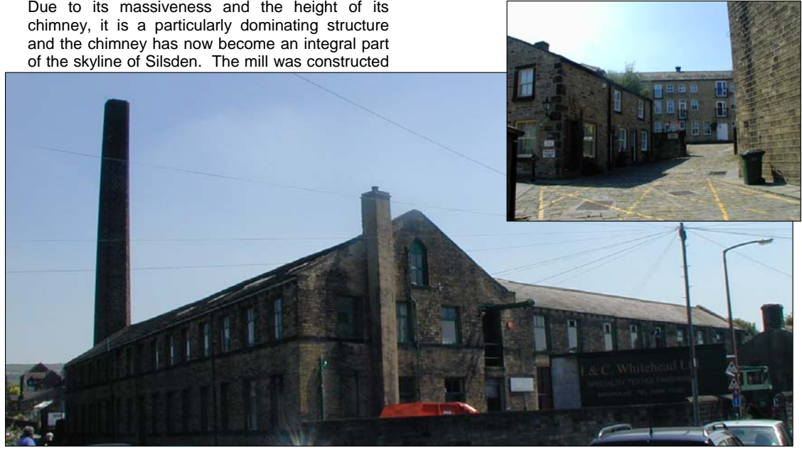
Waterloo Mill - The only Grade II* building in the conservation area and Airedale Mews (unlisted).

In addition to Waterloo Mills there are a couple of other large industrial structures situated within the conservation area. North Mill on Church Street was built in 1846 and functioned as the Primitive Methodist Chapel until 1871, when it was purchased by James Boyes and turned into a textile mill. It is a four-bay structure, constructed of local stone with a slate pitch roof; its distinctive features include three large round-headed windows in the gable wall. It has subsequently been converted to residential use. Airdale shed is situated to the rear of Nicolson's Place. It is a narrow rectangular structure, three-storey, multibayed building, constructed of local stone with a stone slate roof. This has recently been the subject of an award winning conversion scheme.