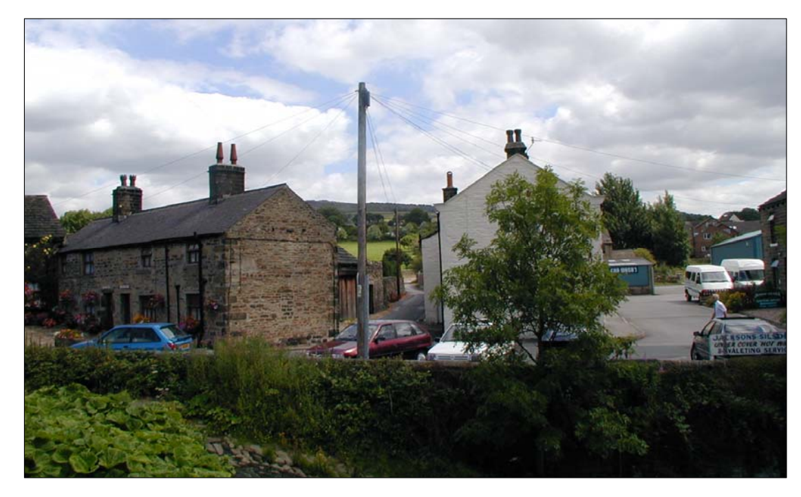
View from Kirkgate of the northern part of St. John's Road, which offers a clearly rural image of the settlement with the roads leading out to the greenery beyond.

separated by a central footpath and adds a feel of openness to this end of the site.