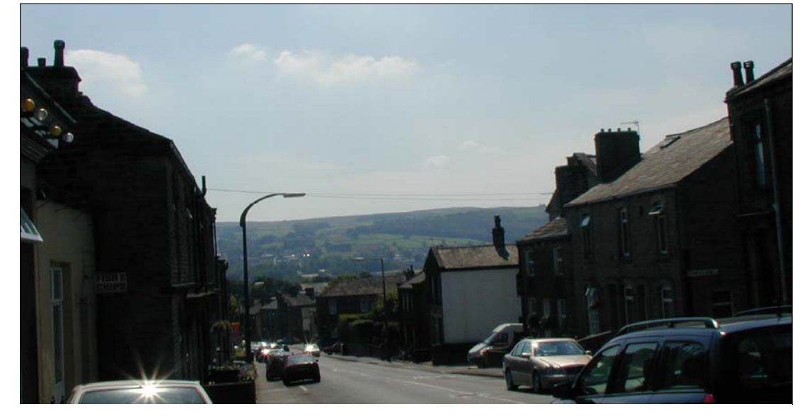
View out of Silsden Conservation Area down Keighley Road. The moors that can be seen beyond the settlement are central to the town's character.

The conservation area has been designated to incorporate the historic core of the town and is bounded by late nineteenth century and early twentieth century terraces to the west, mid to late twentieth century residential properties and parkland to the north and east and the village edge to the south. The boundary clearly follows the line of demarcation between the old street pattern and the later deviations from the pattern. The eastern boundary is at points formed by the line of the beck, which played such an important role in the