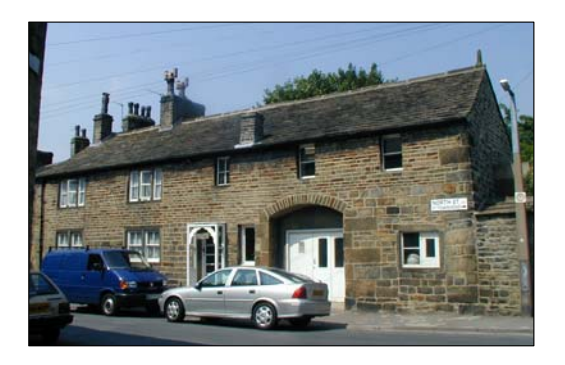
27 North Street (unlisted) – a former laithe house, with characteristic wagon entrance and a stone slate roof.

surrounding this principal building on the larger farms. There are two former laithe houses on the junction of North Street and Pickard Lane, which form the border of the conservation area. The one situated on the actual junction was the Kings Arms when the road was the old coach road through the settlement. The other is located opposite and is now 27 North Street; it is typical of the style of the area, being very simple in design with few decorative features and is constructed of local sandstone with a stone slate roof and small mullioned windows on the farmhouse section. The