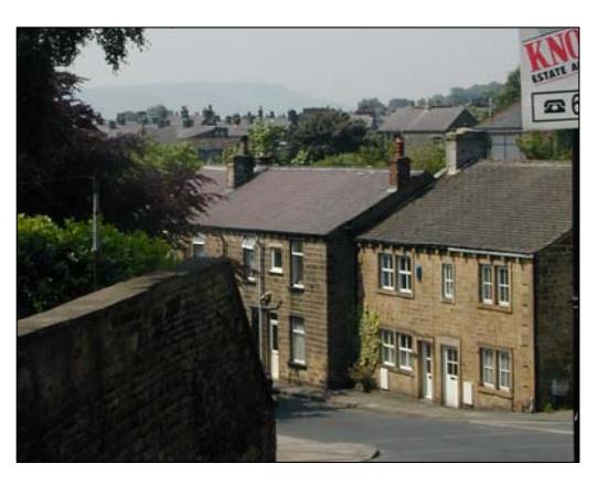
Image across the rooftops of the town to the moorland beyond from the junction of Chapel Street and North Street

yards and evidence of the town's industrial nature, in the form of terraced housing, and areas of wasteland. As a result of the undulation in topography, the roofscape of the town, with its slate and stone slate roofs and combination of the uniformity in form of the terraced areas and the intricacy of the roofline of Kirkgate, forms an important part of its character. The rows of chimney stacks are an integral part of this scene. The most significant vantage points of the structures of the town against the hills are southeastward from the junction of Chapel Street and