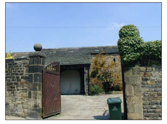
Barn associated with Old Hall Farm (Grade II) – the quality of this area is outstanding.

Farm buildings and their associated dwellings, such as the farmhouse and farm workers cottages, are prime examples of vernacular architecture that were constructed to meet the functional needs of the farming community. There are a number of this building type still in existence in Silsden Conservation Area, although many have been lost and most extensively altered in the course of time, as a consequence of the change of the economic base of the settlement. The Bradley Road area accommodates a group of seventeenth and eighteenth century farms. The large number of Grade II listed buildings on this street, including 10 Bradley Road (Croft House), Old Hall Farmhouse, Old Hall Farmhouse railed forecourt with columns, the barn twelve metres to the north-west of Old Hall Farmhouse, 18,20,22,24 and 26 Bradley Road (formerly listed as Old Hall) and the barn ten metres south-east of no. 20 (Old Hall), testifies to the relative importance of this building group. However, it is not only the buildings themselves that are of high architectural quality, but their settings, with paved yards, gate-piers, boundary