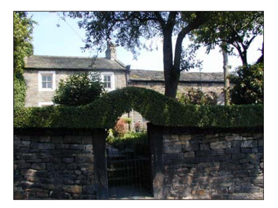
Old Hall and its garden, Bradley Road - through the wall and hedge, which seclude the house from the road.

The area around Bradley Road, Hayhills Road, Highfield Lane and Greengate is quiet and the roads are narrow. Bradley Road is the only thoroughfare, leading from Bridge Street past the older agricultural properties, through the suburbs to the moors beyond and is the widest and most domestic of the roads in this part of the conservation area. The remaining roads are poorly surfaced with tar macadam that is breaking up in areas. The forms of the farmhouses, cottages and barns of the area still exist, although they have subsequently undergone alterations to