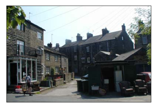
Stirling Road with its collection of cottages and a small workshop, evidence of the existence of a cottage industry in the settlement.

The Industrial Revolution occasioned the construction of large industrial premises within the confines of the town. Although the scale and style of these buildings is completely at odds with the earlier smaller buildings, there is some continuity in the use of materials. The majority are faced in the same local stone, but have slate roofs. Slate became increasingly available due to improvements in transportation methods, such as the canal and the railway. Waterloo Mill is the largest and most significant industrial building of the settlement. It is a Grade II* listed building situated close to the city centre on Howden Road. Due to its massiveness and the height of its