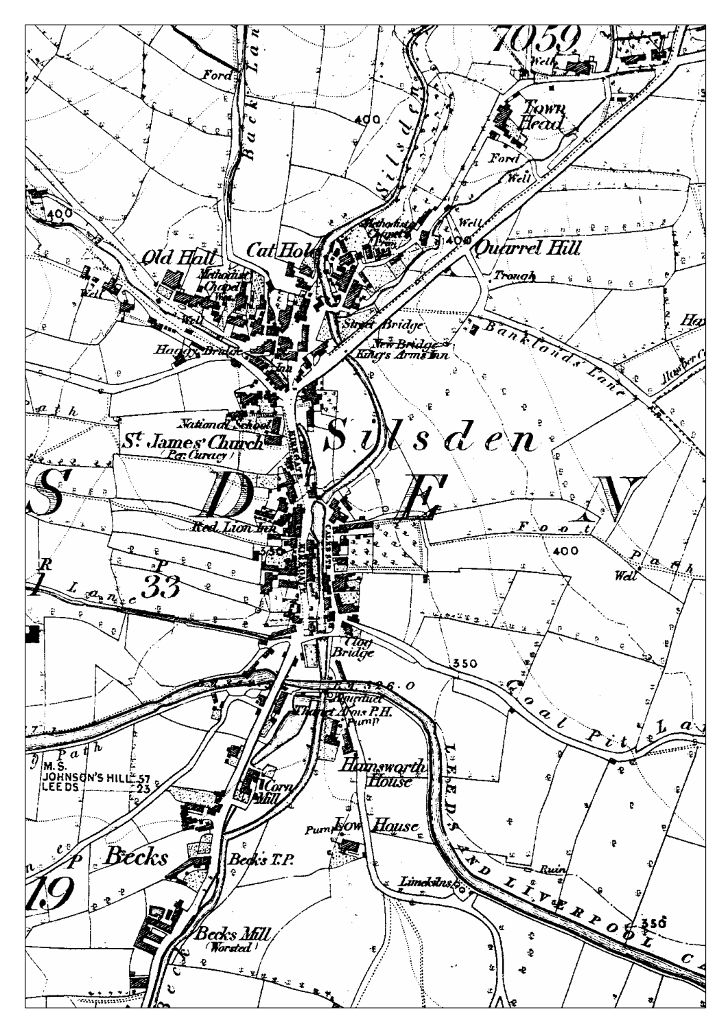
1<sup>st</sup> ed. OS 6": 1mile (sheet 185, surveyed 1848, not to original scale