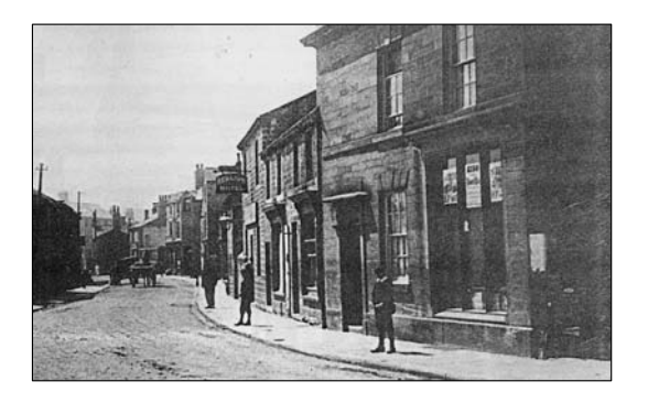
Kirkgate about 1900.

early period of change mainly followed the lines of the existing roads. However, the roads did become more established and less sprawling in nature. Kirkgate itself is a late eighteenth century road that is superimposed upon the former route known as Towngate. St. John's Street was also formally laid out at this time, but was in 1848 known as Caleb Street. The name of the road later changed to St. John's Street in recognition of the Order of St. John, that once owned property on the street and their emblem of a single cross is still evident on one of the gable apexes. The major alteration to the road network during the first half of the nineteenth century was the construction of the nineteenth century turnpike road that climbs steeply to the north-east out of the town across the moors to Addingham, diverting traffic away from what are now Chapel Street and North Street. This remains the only major route that crosses the Aire and Wharfe valleys in the fifteen miles from Skipton to Shipley and as a result is particularly busy.