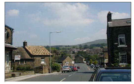
View into the conservation area from Skipton Road, which emphasises the rural aspect of the settlement.

There are relatively few green spaces within the conservation area, as the buildings are characteristically small and closely packed with small back vards. The public green spaces are congregated around the central, civic area of the conservation area. The largest green space is the parkland to the west of the conservation area. Although it is not situated within the confines of the conservation area itself, it does provide the backdrop for many of the buildings situated on this side of the town. The view down Wesley Place of the church with the parkland behind is particularly attractive and the open perspective of this space also serves to enhance the rural dimension of the properties of Mitchell Lane and The Paddock. There is a second area of open parkland beyond the north-western boundary of the conservation area. This is essentially two small fields,