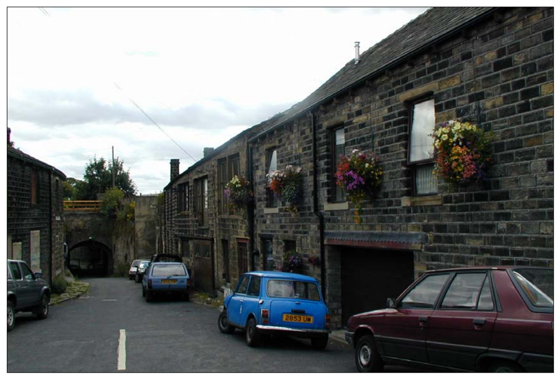
View down Hainsworth Road to the Aqueduct (Grade II) – an attractive street, although part of it is in a semi-derelict state. This is a traditionally industrial part of the settlement: a forge has been on the site of one of these buildings for over five hundred years.