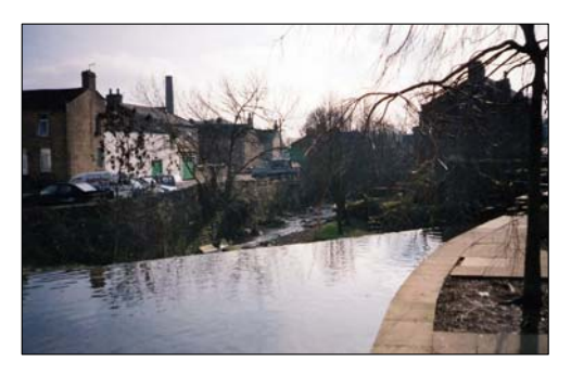
Silsden Beck with St. John's Street in the background