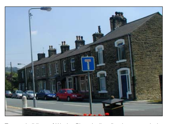
Terrace buildings of Wesley Place (unlisted) – they are typical of the area being constructed of local stone with slate roofs.

Nineteenth century and early twentieth century terraced buildings were established in Silsden to house those that were attracted to the area to work in the mills and manufacturing firms. The majority of these are situated outside of the conservation area boundary, but there are a number within the designated area. These range from the simple structures with little architectural detailing to the more ornate with moulding around the door and window architraves and bay windows. The construction materials remain constant. Detached residential properties of the late nineteenth and early twentieth century are situated along the length of Kirkgate. Some of these were originally farmhouses and the later ones acted as middle-