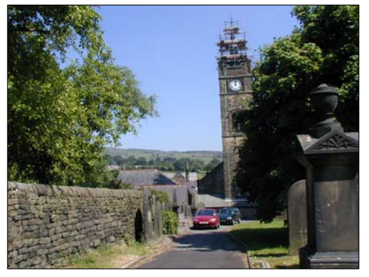
View of the moorland on the edge of the settlement past the church. The colours of the elements complement one