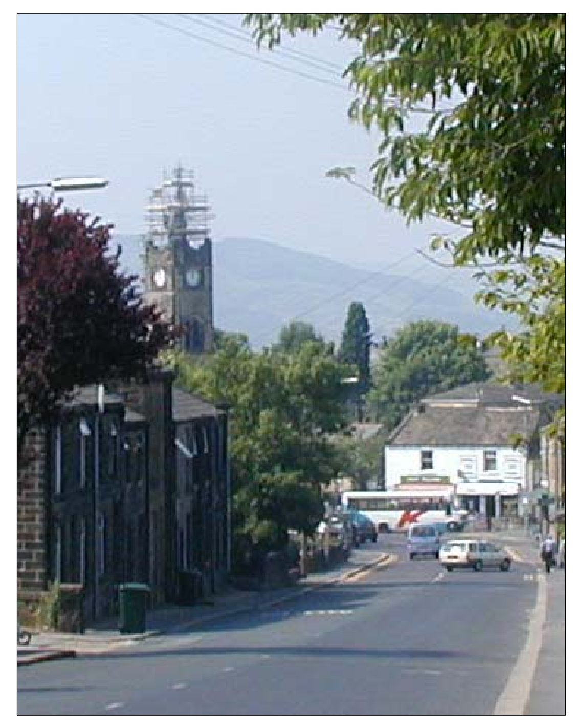
View of the heart of Silsden on the approach from Bolton Road