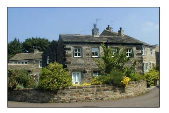
Pear Tree Court – integrating Grade II listed buildings with modern development.

making industry, has been subject to a Civic Trust Award (1998) winning conversion scheme and is now Pear Tree Court. The scheme incorporates new building with listed buildings, using reclaimed materials following the vernacular style in both the design and disposition of the new houses. Immediately to the north-east of this is the conversion of North Mill and an extended residential unit to the rear that respects the scale and materials of the original mill building. These two developments viewed alongside one another testify to the change of uses the area has undergone. Evidence of the cottage industry of the town exists in the form of a number of properties: for example, 3 and 4 Stirling Street (Grade II), are relics of this cottage industry tradition, with a two storey workshop situated opposite them; as far as can be ascertained this small building is the only workshop to survive in the town. Also, two eighteenth century cottages on Briggate (10 and 16) exhibit blocked first floor taking-in-piece doorways, which are specific reminders of the importance of the handloom weaving industry to the local economy.