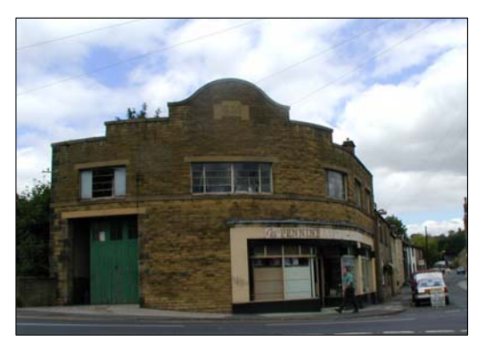
The Co-op building (unlisted) – constructed in the 1930s and Art Deco in style.

Throughout Silsden, houses, cottages and mills are built from the local stone, which has distinctive orange and brown staining, indicating that the stone has been quarried from shallower local guarries where the iron minerals in the stone have oxidised. The stone has been hammer finished on most of the older vernacular structures, but to confer a certain status on the buildings, the turn-ofthe-century (nineteenth - twentieth) buildings were constructed of smooth faced ashlar stone arranged in large dominant blocks and the rougher uncoursed rubble was utilised for the retaining walls. This continuity in use of local stone has created uniformity in colour and texture throughout the conservation area. Historically, most of the roofs in Silsden were constructed of natural stone slates, but from the mid-nineteenth century onwards, as a result of the improvements in transport, Welsh blue slates were brought in by railway. Over time the