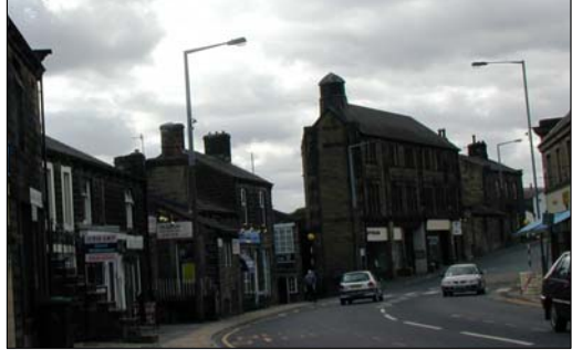
The Co-operative Society building (unlisted) – unusual in design and situated at a prominent terminal point of Kirkgate

to the street. The Conservative Club building is also a particularly impressive structure and due to its prominent positioning on the junction of Briggate, Kirkgate and Bolton Road, has become a focal point of the town. It is a three-storey, stone structure with a hipped slate roof, broken by one small gable on the Briggate elevation and another on the Kirkgate elevation. It has mullioned windows and a canted turret with a conical metal roof. The Co-operative Society building, built in 1908, on the junction of Kirkgate, Keighley Road and Clog Bridge is also a very dominant structure due to its positioning, offering a terminal point of vision from the twisting Kirkgate . It is constructed of local stone and has a slated roof and mullion windows, typical of buildings in Silsden of this era.