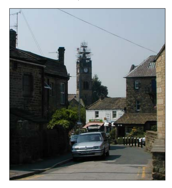
View encapsulating the village atmosphere of Silsden from Bridge Road

Silsden conservation area has four distinct character areas that are based on current and past major land uses: areas that are agricultural in scale, industrial areas, retail areas and a civic area. This however is not to imply that these areas are employed exclusively for the use identified; it is often the mixed use nature of the areas that maintains their vibrancy. The agricultural scale areas have typically evolved to serve either residential or industrial purposes, as agricultural activity is now focussed beyond the realms of the settlement, and the specific character of each is