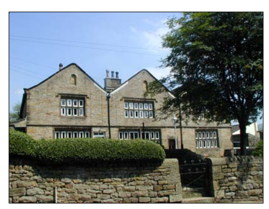
Old Hall (Grade II) – the finest vernacular structure of the settlement.

walls, hedges and long gardens are also important. The Old Hall (now 18, 20, 22, 24 and 26 Bradley Road) is the finest vernacular building in Silsden. It is a two storey property constructed of coursed rubble with dressed quoins, mullioned and transomed windows and a stone slate roof, all characteristic features of the local vernacular. Associated with this building group, is a small residence situated on the opposite side of the beck, now numbers 5 and 7 Greengate, a particularly interesting feature of these properties is the architrave detail around the door to number 7.