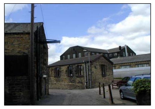
View into Sykes Lane of the small-scale warehouses situated on a setted street.

A number of rows of these terraces stand perpendicular to the main street and others run parallel to it; there is little uniformity in the orientation, continuing the character of Kirkgate. Larger residences such as that dated 1838, which forms part of Albert Square are also evident. The orientation and spacing of the buildings has produced open spaces, which are often unsurfaced and without a use, many become muddy tracks during the winter months. The car park to the rear of the Grouse Inn is poorly surfaced, but does have a function as a car park. It also offers attractive views of the rears of the terraced buildings and due to its proximity to the fields its atmosphere is rural. The main concern is the site opposite Mill Banks, which is a fenced concrete space with no evident use.