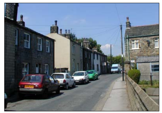
Cottages of St. John's Street (some Grade II)

early factory workers. These cottages are typically very semi-detached or small rows of terraces, and are commonly single or two-celled properties constructed of local, usually hammer dressed stone. The windows are traditionally small and the earlier ones have stone mullions. The corners of typically have large stone quoins and tabled gables with large copingstones to the stone-slate roof. Some of these buildings have undergone alterations, either from cottages to form larger dwellings or retail establishments, or from houses to form smaller cottages. There are a number of cottages in the area that are Grade II listed, including Pear Tree Cottage 22 Bridge Street, 7 -9 Chapel Street, 43 Kirkgate, 1,2 and 3 Nicolson's Place, 3 and 4 Stirling Street, 9, 11, 13 and 15 St. John's Street and 55 St. John's Street.