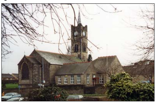
St. John's Church (Grade II)

Three ecclesiastical buildings of different denominations huddle around the Wesley Place area in the centre of the conservation area. Two of the buildings are listed as Grade II structures: the Roman Catholic and Anglican Churches. The Roman Catholic Church of Wesley Place was constructed in about 1870 as a Weslevan Methodist Church, but was later adopted by the Roman Catholic religion. It is Gothic Revival in style and built to a cruciform plan. Its most prominent features are the set five-light arched window with geometrical tracery on the west elevation and the doorway with triangular hood. The Anglican Church was constructed on Kirkgate in about 1816, although the tower, which contributes greatly to the skyline of the settlement, was raised later by George Jacques in 1896. The gates to the church are also listed Grade II