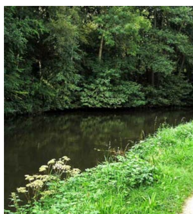
Top: Strangford Swing Bridge, Esholt. Above: Dense woodland on the west side of the canal. Bottom Right: The northern approach to Esholt Sewage Works and the Strangford Swing Bridge.