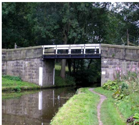
Above: Lodge Hill Bridge, one of the few canal structures along this stretch of the conservation area