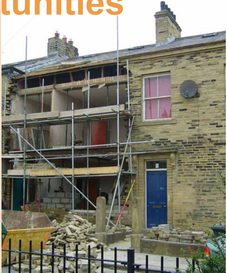
Repair works being undertaken on Hanover Square