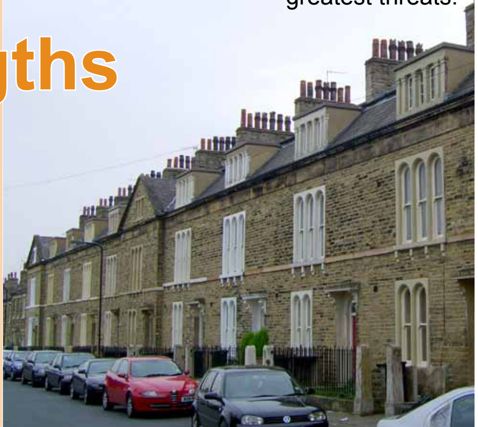
Well detailed buildings along Hanover Square.