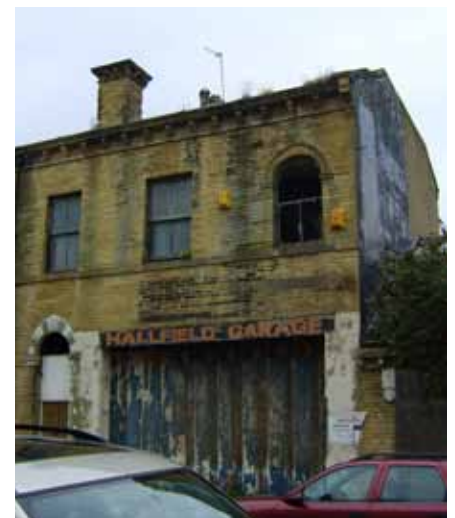
Vacant building on Hallfield Road in need of new use.