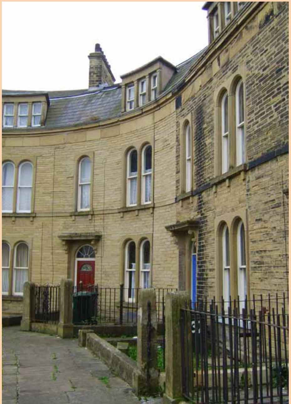
Sweeping curve of traditional terraced houses on Hanover Square.