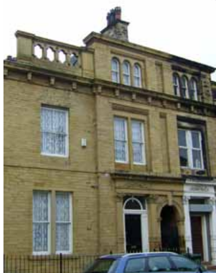
Top right: Good example of a traditional roofscape with unaltered chimneys along Peel Square. Top left: Decorative bargeboards would have been a feature of the area. Above: Retention of traditional features such as sash windows and pillar details along Hallfield Road.