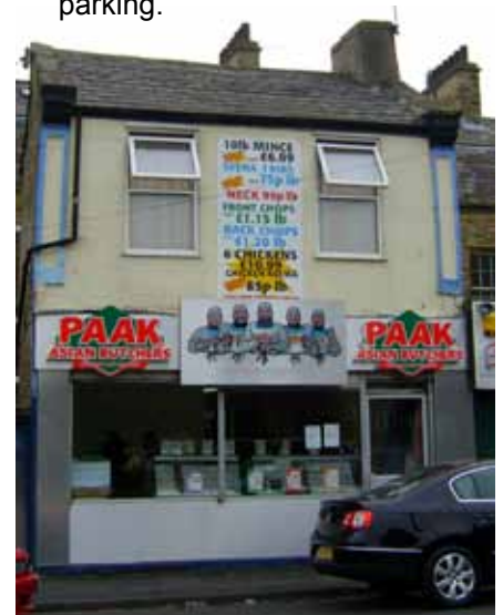
Altered shopfront on Lumb Lane