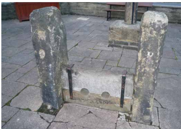
The stocks on Northgate