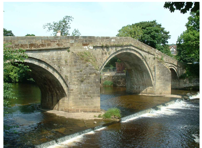
Ilkley old bridge

Go through the gap in the fence, which leads off New Brook Street and go down the ramp, which leads down onto the Riverside path. Follow the river downstream to eventually emerge onto Denton Road via a gap in the fence at the far end of the field. Turn right here and follow the road for approx 250 yds (229m), turning right again to cross the river by the suspension bridge. Once across turn right and follow the river along the surfaced path upstream on the opposite bank, passing Ilkley