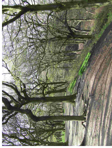
Jagger Park Wood