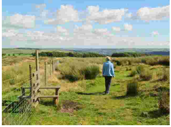
Path near Brass Castle