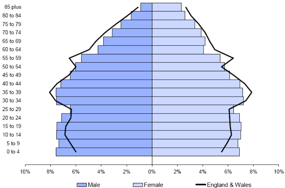
Figure 1: Bradford's population structure compared to the UK's average