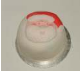
A finished cake

Christmas cakes. Jayne had baked lots of mini cakes and showed the group some handy techniques. They went on to form a production line and completed quite a few to be sold for church funds.