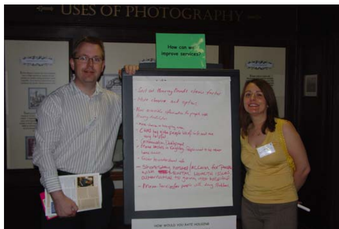
Members of the Supporting People Team