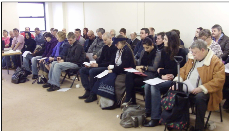
Above: Service User Involvement Group Meeting