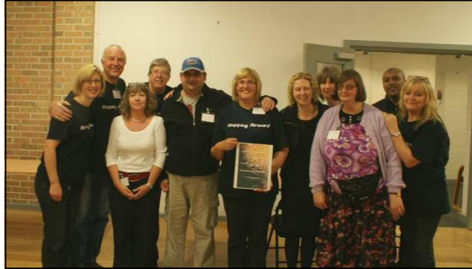
Above: The City Homes in Mind Team of staff and residents

The City Homes in Mind Team presented Stepping Forward as an innovative example of good practice in implementing personalised services at the SITRA Festival of Ideas event in Leeds on 11th October 2011. They won the prize on the day for 'most innovative and creative session'.