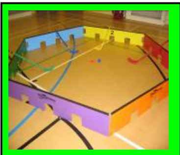
Big Box Hockey Set