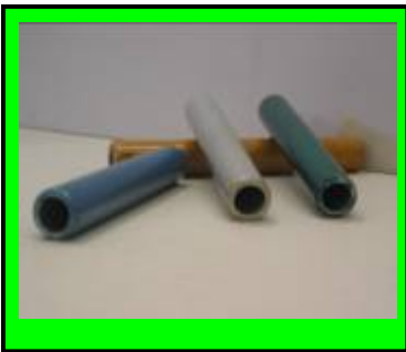
Relay Batons Age: 5+