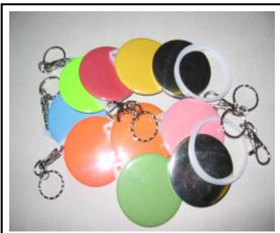
Key Ring Parts