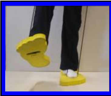
Monster Trek Feet