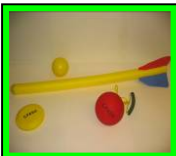
Foam Athletics Set