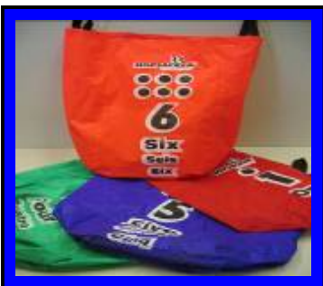
Hop Sacks (6 Sacks)