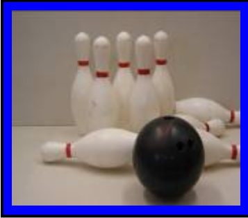
10 Pin Bowling Set (Plastic)