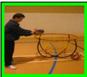
Giant Go For Goal Age: 5+