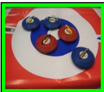
Indoor Curling Set