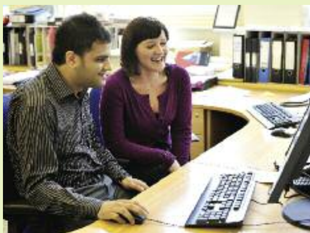
The Jobs@ service works with individuals in communities and supports them into work.