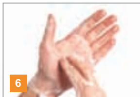
Rotational rubbing of palms; right fingers to left palm and vice-versa