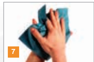
After washing, rinse hands under running water and dry thoroughly on paper towels