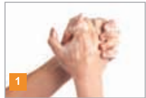
Wet hands, apply soap and lather palm to palm