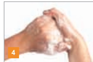
Wash with backs of fingers to opposing palms, fingers interlocked