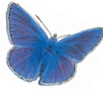
Common Blue Butterfly

Sandwiched between the mixed wooded copses and the young Birch woodland, the area has two wildflower meadows both seen at their best during mid June through to early July giving a spectacular display of colourful wild flowers and grasses matched only by a sea of purple heather on the heathland during late July into early August.