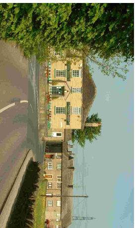
Rock & Heifer