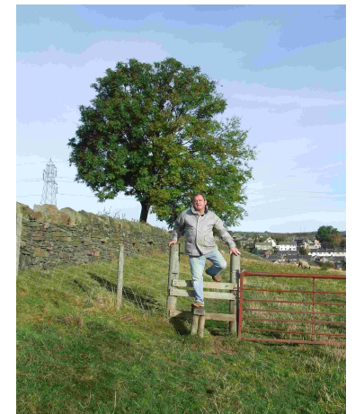
Footpath to East Morton