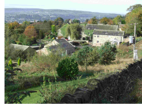
Near West Morton