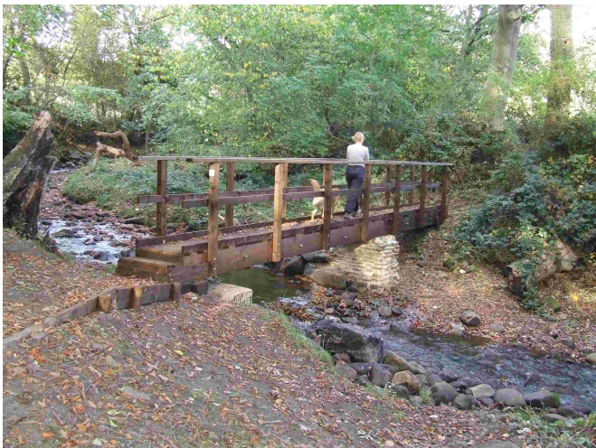
Footbridge over Morton Beck

City of Bradford Metropolitan District Council Countryside & Rights of Way Service 4th Floor, Britannia House, Hall Ings Bradford BD1 1HX Tel: 01274 432666 Web: www.bradford.gov.uk/countryside