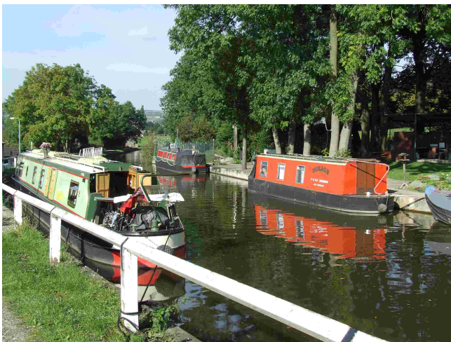
Leeds and Liverpool Canal near Crossflatts