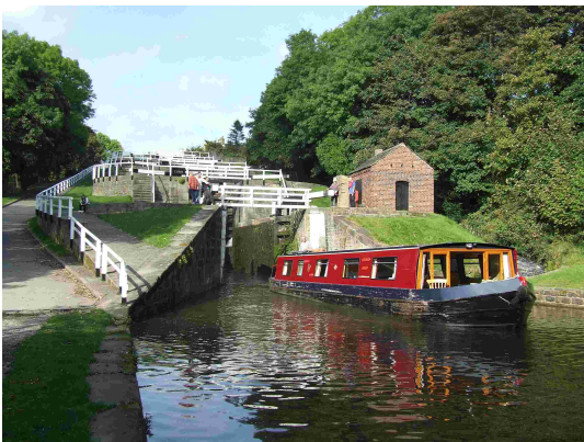
Five Rise Locks - Leeds and Liverpool Canal