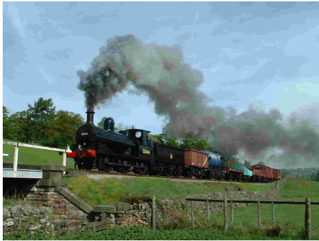
The Keighley and Worth Valley Railway Line

(Allow at least 6 hours to complete the 11 mile/17.5km walk).