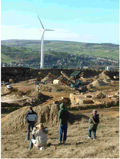
Naylor Hill Quarry, Brow Moor