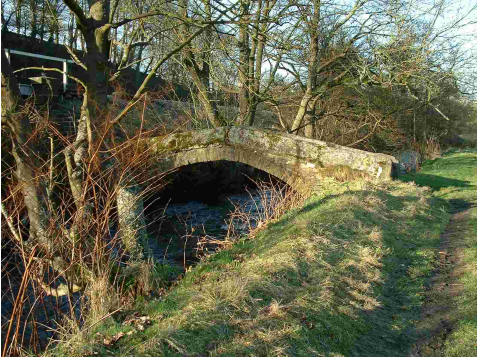
Donkey Bridge, Bridgehouse Valley