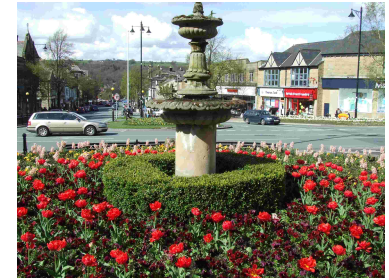
Walk start point - The Grove