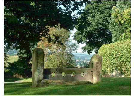
The stocks at Nesfield