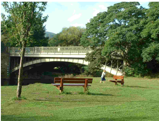
New road bridge, Ilkley