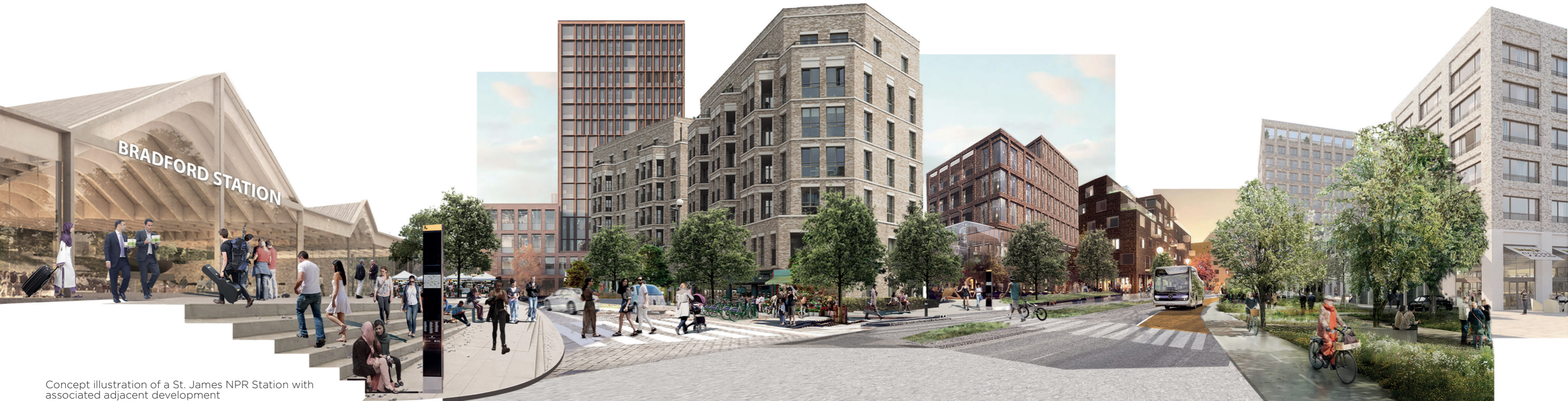
Concept illustration of a St. James NPR Station with associated adjacent development

Wider connectivity Reaching outwards with excellent connections to the City Centre and communities across Bradford