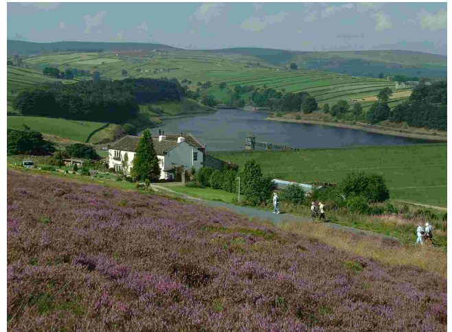
'Hill Top' Cemetery Road, Haworth (walk start and finish)

Cross the bridge and climb the steps on the other side which will lead you into a field, here follow the stone wall