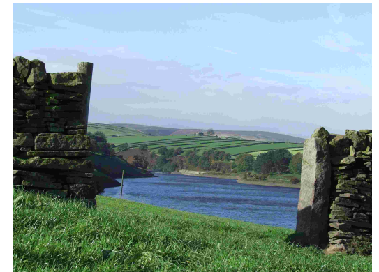
Lower Laithe Reservoir