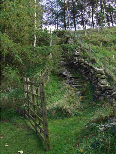
Steep steps at Hollings

follows the wall on your right steeply uphill before finally reaching a second shorter flight of steps leading up to a stile over a stone wall out onto Sun Lane. At this point public transport users can finish their walk by turning left uphill to the bus stop and Haworth village. To continue turn right downhill for 100yds (91m) or so before crossing the road to