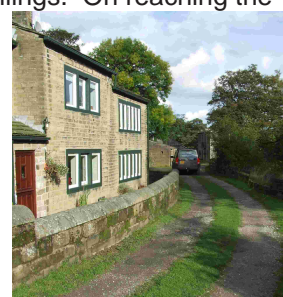
Former mill cottages at Hollings

Immediately after turning left the narrow road divides, here follow the right hand surfaced access road leading down to Milking Hill Farm. At the bottom of the access road continue by crossing the farmyard in front of the white painted farmhouse to the far end of the buildings, before turning to your right across the now concreted farmyard passing between the sheep pens on your left and the farm buildings on the right to a field gate. Go through the gate and follow the path down the wall on your right hand side to a stile at the bottom of the field. Climb the stile onto a rough road turning immediately to the left to climb a second stile to enable you to walk straight ahead along the road which leads to the hamlet of Hollings. On reaching the next gateway along the track just prior to the cottage on your left hand side turn right here to walk across a wide grass covered bridge to climb the steep flight of stone steps (which can be slippery when wet) leading up the hillside to a stile at the top, out into a field. From here the footpath