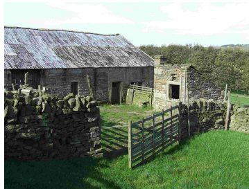
Near Enfield Side